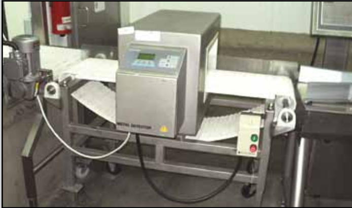
LOMA STS METAL DETECTOR

HOLLYMATIC 4200 Series Horizontal Tumbler-Mixer-Grinder , ribbon mixer, with auger feed to 6" grinding faceplate, assorted change plates. 2006 AMFEC VI-B Stainless Steel Hydraulic Portable Elevator , 750-lb. capacity.