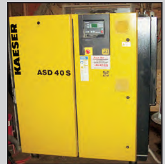
KAESER COMPRESSOR WITH VS DRIVE