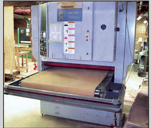
TIMESAVERS 43" WIDE BELT SANDER 2