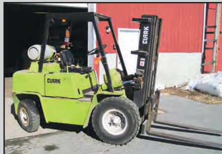
CLARK 7,500-LB. FORKLIFT

BUSHAMON, MUNTI-TON, and LIFTRITE Hydraulic Pallet Jacks.