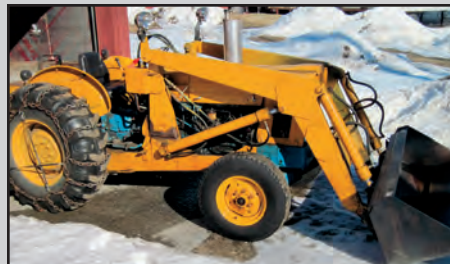
FORD D5011F TRACTOR