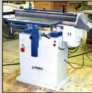
REHNEN HORIZONTAL EDGE BELT SANDER