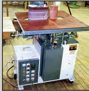
PROSAND HF-412 AO SANDER

Large Assortment of Clamping and Spray Finishing Equipment, including Taylor 40 station rotary clamp carrier, vacuum spray pots with spray guns, bar and C-clamps, RF gluers, and related equipment.