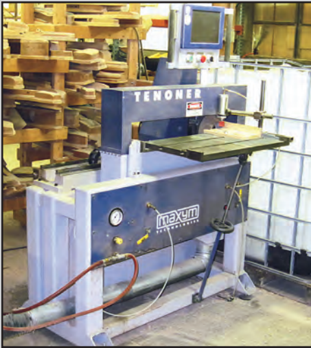
MAXYM CNC TENONER