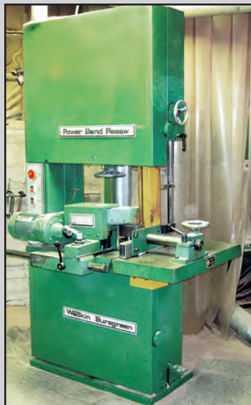
WADKIN VERTICAL BAND SAW