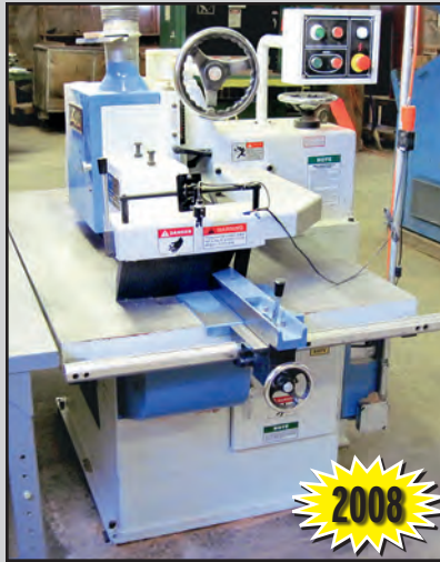
LOBO RIP SAW