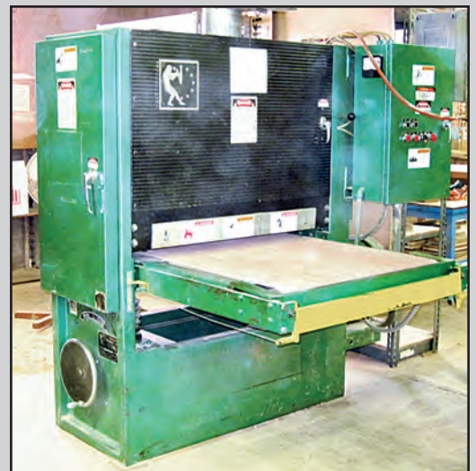
TIMESAVERS 37" WIDE BELT SANDER