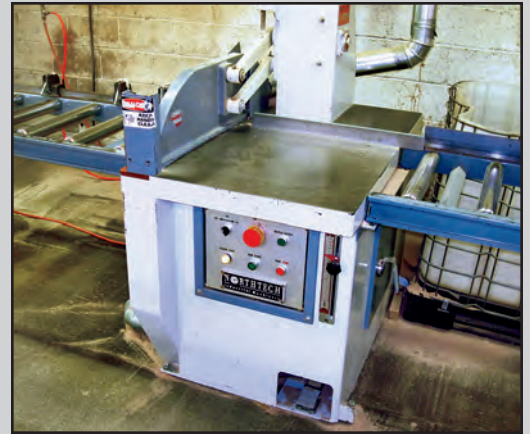
NORTHTECH PNEUMATIC UP-CUT SAW