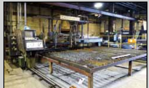
CNC FLAME CUTTING TABLE

(9) LINCOLN DC400 Welders, with LN-7 wire feeds.