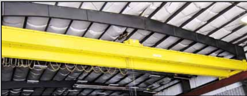
(1 OF 2) LIKE-NEW DETROIT 15-TON BRIDGE CRANES