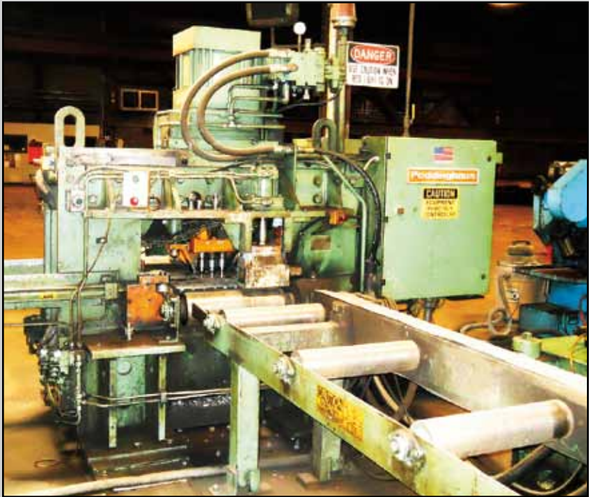
PEDDINGHAUS FPB-500-3C CNC PUNCHING AND PLASMA CUTTING FABRICATION MACHINE

HYPERTHERM MAX 200 PLASMA CUTTING POWER SUPPLY