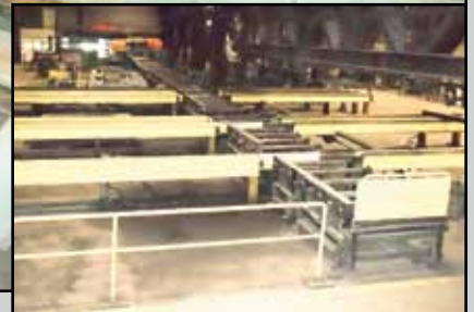
PEDDINGHAUS PCD 1100 CNC BEAM FABRICATION LINE – CONVEYOR SYSTEM