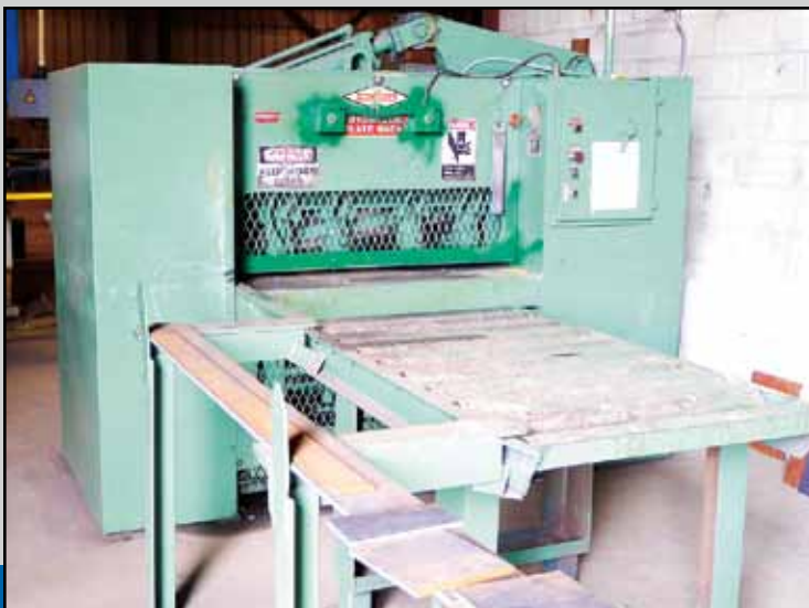
METAL MUNCHER PS4800 HYDRAULIC PLATE SHEAR