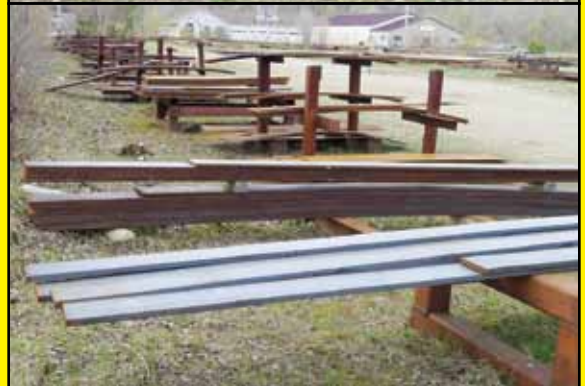
SAMPLE STEEL INVENTORY