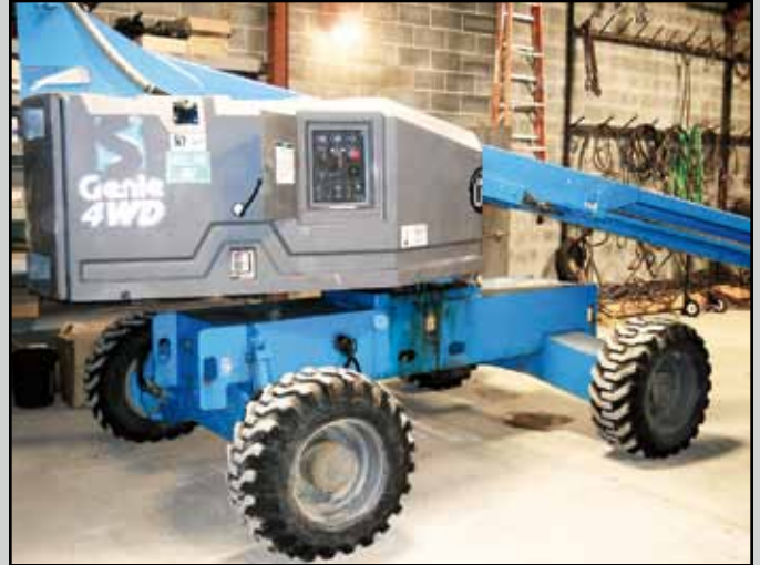
GENIE 4 X 4 DIESEL BOOM LIFT