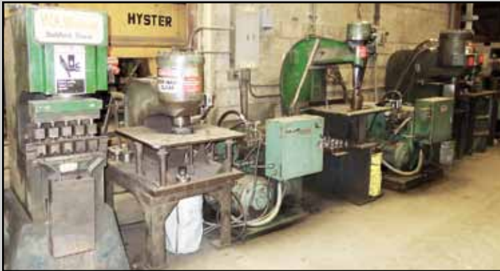
WHITNEY C-FRAME PUNCH PRESSES