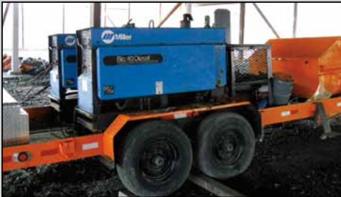
MILLER BIG 40 DIESEL WELDING GENERATORS ON TRAILER