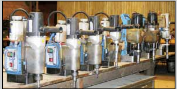
MAGNETIC BASE BROACHES