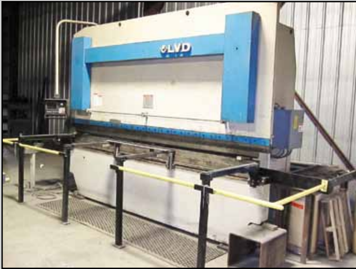
LVD 240 JS-13 HYDRAULIC BENDING BRAKE