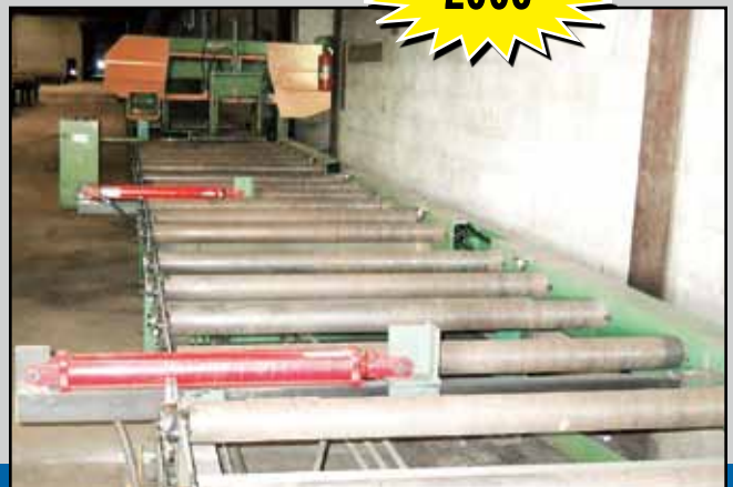
PEDDINGHAUS MEBA 410 DG CNC HYDRAULIC METAL CUTTING BAND SAW – CONVEYOR