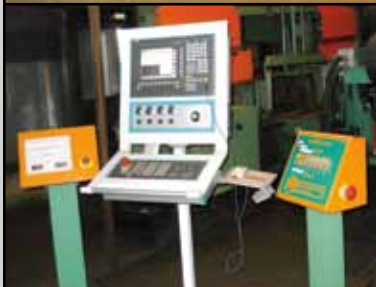
PEDDINGHAUS PCD 1100 CNC BEAM FABRICATION LINE – CNC CONTROLS