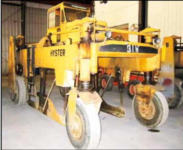
(1 OF 5) HYSTER STRADDLE CARRIERS

Extensive Selection of Construction Grade Power Tools Including HILTI Hammer Drills and Ram Sets, STIHL and HUSQVARNA Gas Cut-Off and Chain Saws, TOWE HD Torque Guns, Welding Tools and Accessories, and Much More!