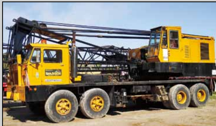
BLH LIMA 700 T 70-TON LATTICE BOOM TRUCK CRANE