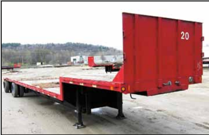
DROP DECK TRAILER