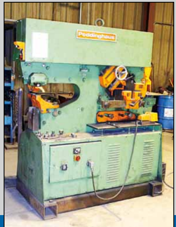
PEDDINGHAUS PEDDIMASTER 66-110H IRONWORKER