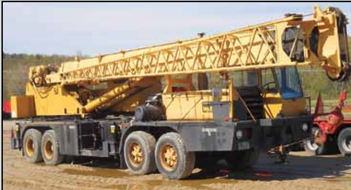
GROVE TMS300 HYDRAULIC BOOM CRANE