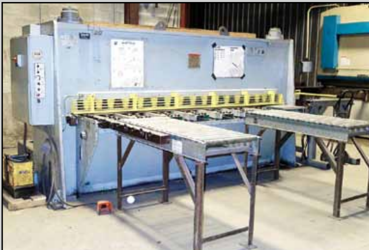
LVD JS 50-10 HYDRAULIC SHEAR