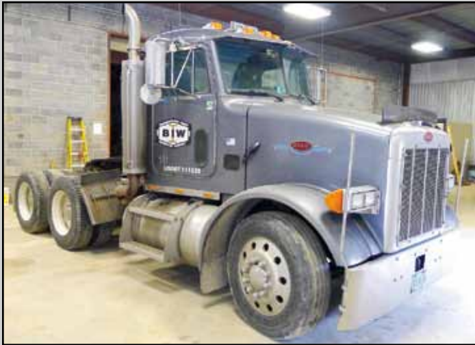
(1 OF 2) PETERBILT 357 T-A HIGHWAY TRACTORS