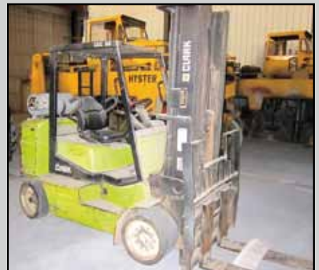
CLARK CGC50 LP FORKLIFT