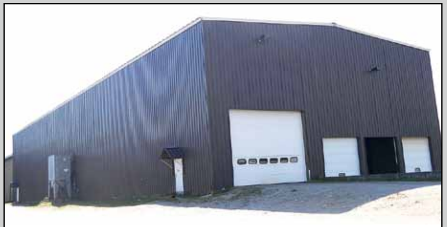
SAMPLE CLEAR SPAN STEEL BUILDING IN COMPLEX