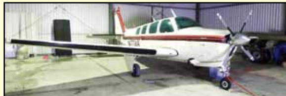
BEECHCRAFT A-36 BONANZA

Complete Survey Information Available Upon Request – Aircraft Subject to Prior Sale