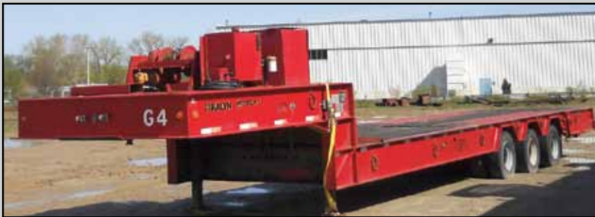
KALYN K14T-3-35T TRI-AXLE HYDRAULIC GOOSENECK TRAILER