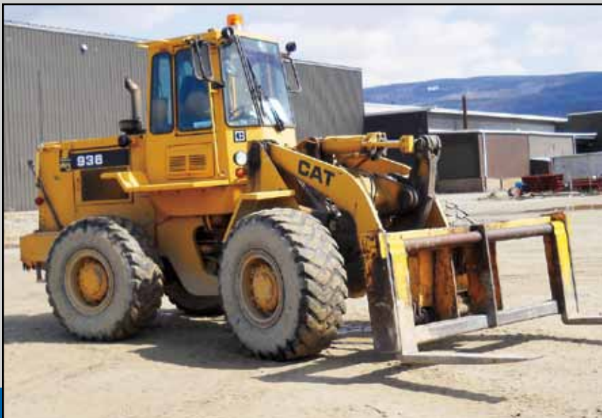
CAT 936 WHEEL LOADER WITH FORKS

(2) HYSTER Straddle Carriers, M300H rubber tired, 86"W x 57"H, 30,000-lb. cap.