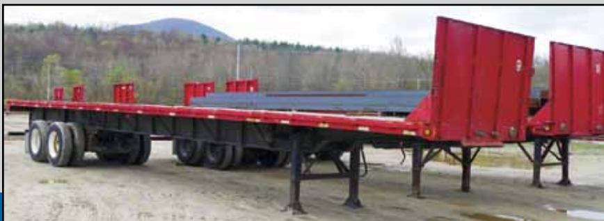
(2 OF 12) FLATBED TRAILERS