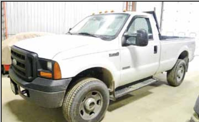
(1 OF 5) FORD F350 PICKUP TRUCKS