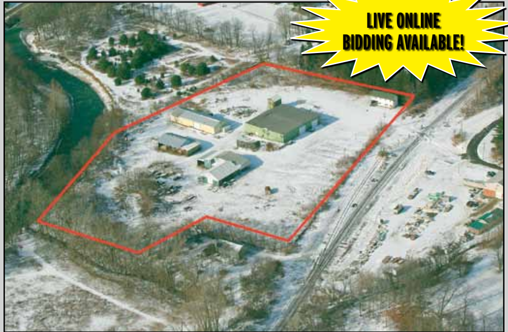
33-39 CHURCH STREET