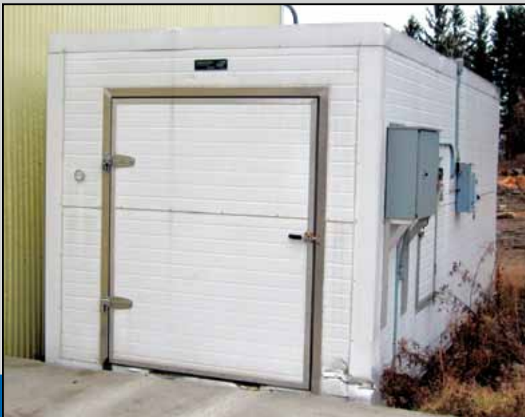
NORTHLAND NK-3 DRY KILNS