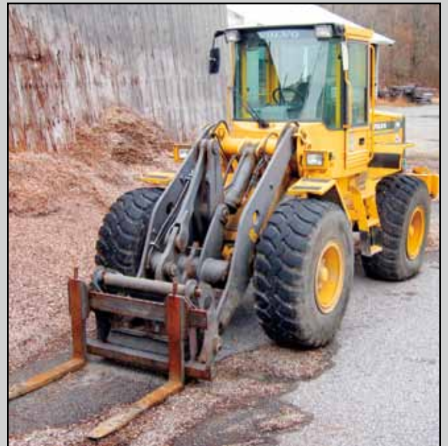
VOLVO L70C WHEEL LOADER, WITH FORK ATTACHMENT