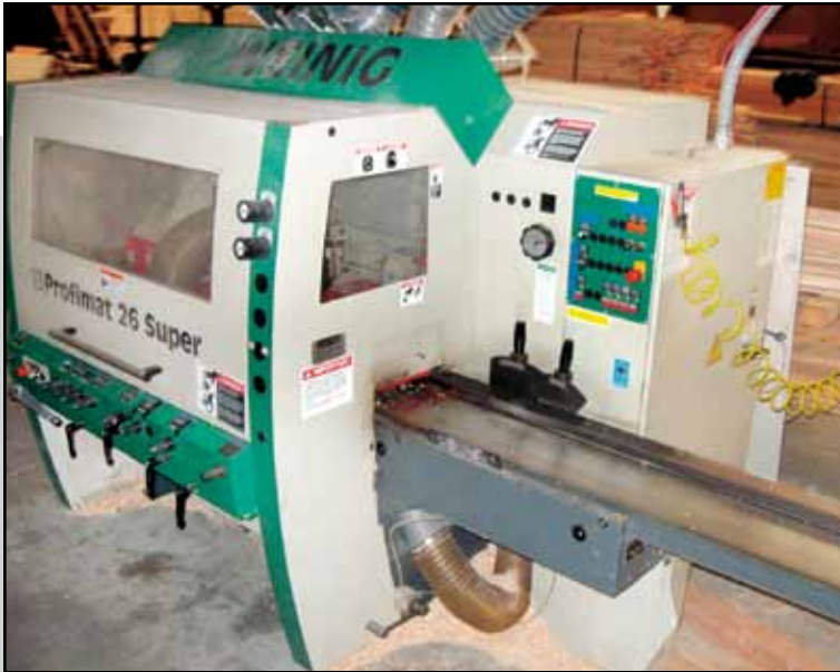
WEINIG PROFIMAT 25 SUPER 5-HEAD MOULDER