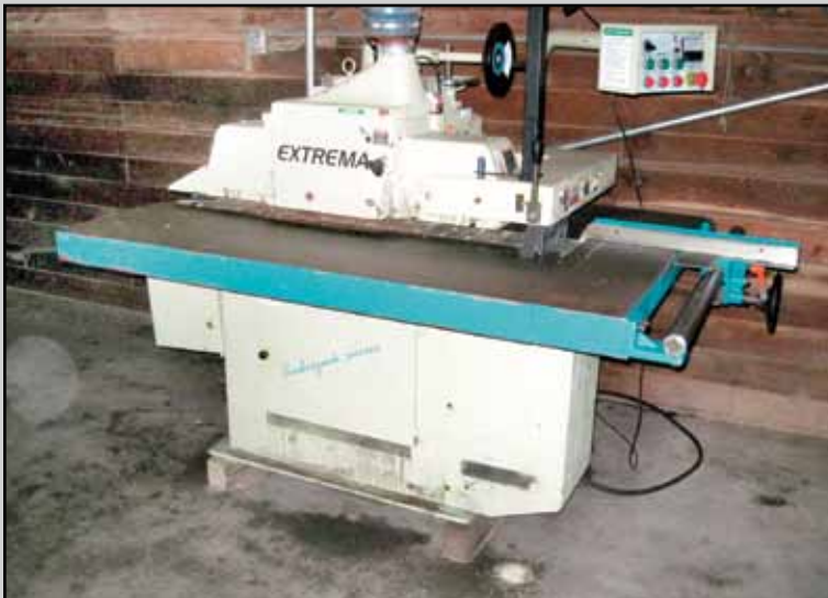
EXTREMA RIP SAW

For complete details, visit our website: www.crgauction.com