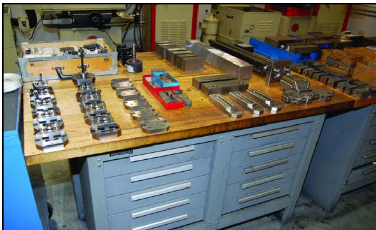
View of EDM Tooling & Accessories

Catalog, Terms, Info: www.JosephFinn.com • Online Bidding: www.Bidspotter.com