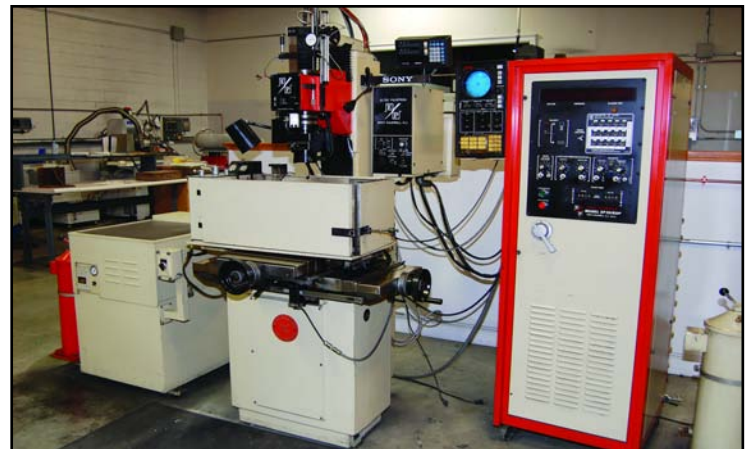
1 of 3 ELTEE Pulsitron Sinker EDMs