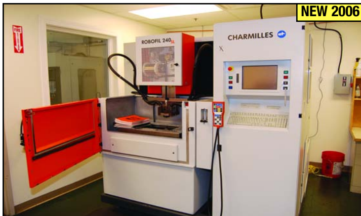
CHARMILLES ROBOFIL 240SL CNC EDM

Inspection Tues., Jan. 13th, 9-5 & by Appt. Catalog, Terms, Info: www.JosephFinn.com Online Bidding: www.Bidspotter.com