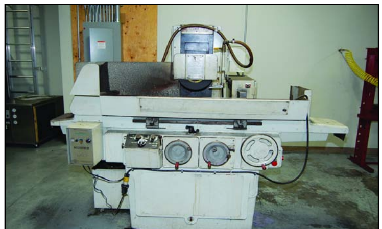
BROWN & SHARPE 1030 Micromaster Grinder