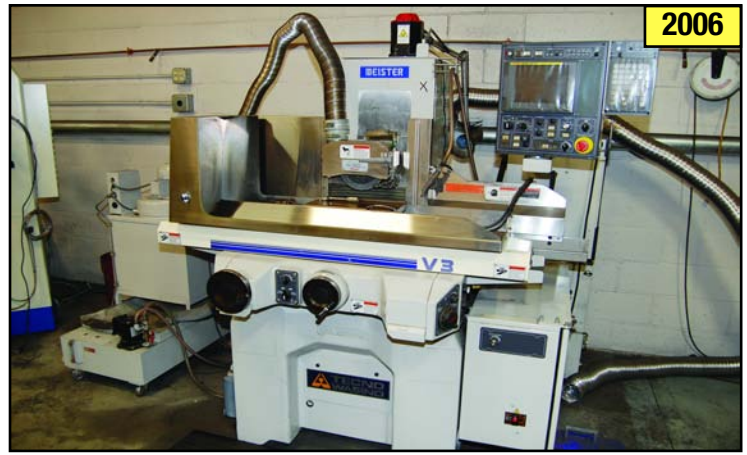
TECHNO MEISTER V3 CNC Forming Grinder