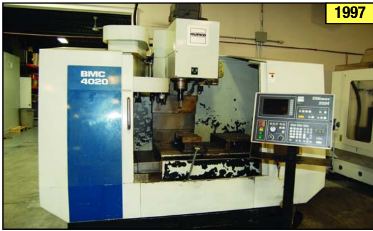
HURCO BMC 4020 Vert. Machining Center