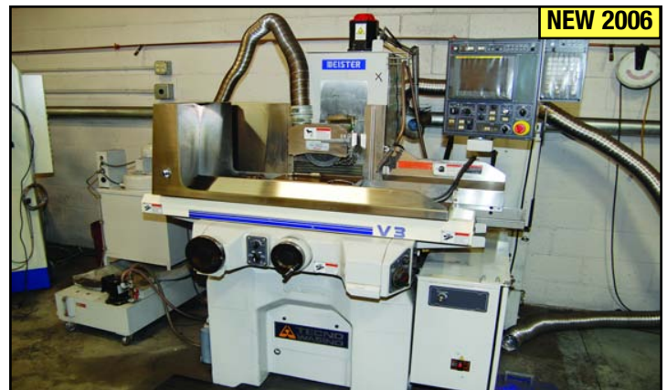
TECHNO MEISTER V3 CNC Forming Grinder

On-Site Terms: 25% deposit cash, cftd. ck. or bank letter honoring payment w/unctfd. cks. A 12% Buyer's Premium will apply. Other terms at sale.