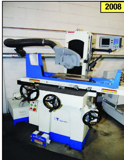
SUPERTEC 618M Grinder