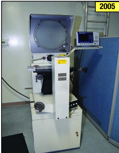
MITUTOYO PH3500 Comparator

HARIG Grindalls, Wheel Dressers, IMPERIAL Grindit Rotary Head, Indexers, Flex Shaft Grinders, Chucks, Tool Holders, Collets, (8) KURT Machine Vises, Precision Vises, Hold Downs, Angle Plates, Rotary Tables