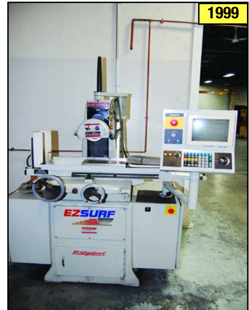
BRIDGEPORT EZ Surf Grinder