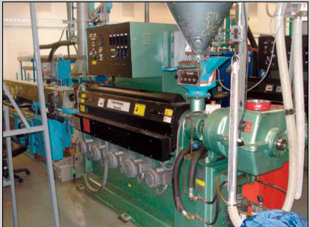
(1 OF 2) DAVIS STANDARD 2-3/4" HORIZONTAL PLASTIC EXTRUDERS