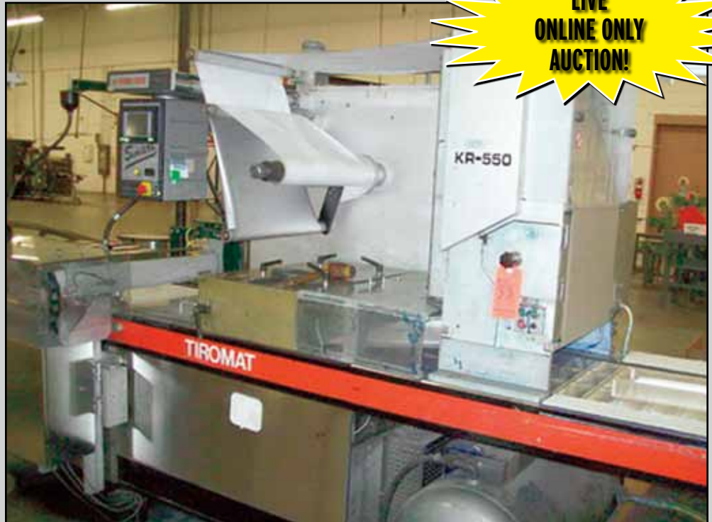
KRAMER-GREBE SS TIROMAT ROLLSTOCK VACUUM PACKAGING MACHINE