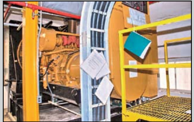
CAT DIESEL GEN SET

2001 CATERPILLAR 3508B 100 kW Cold Start Diesel Generator, 8-cylinder, 4-cycle turbo-charged engine, w/after cooler, Cat SR4-B AC generator, 910 kW prime, 832 kW continuous skid-mounted, 1,200 KVA, digital voltage regulator, battery start, remote annunciator, only 216 hrs.