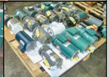
SMALL SAMPLE OF NEW PARTS, SUPPLIES, & STORES