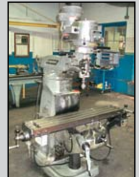
BRIDGEPORT VERTICAL MILLING MACHINE