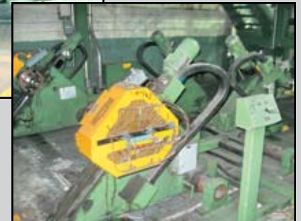
(1 OF 7) PAYOFF-UNWIND STANDS ON SHEETER