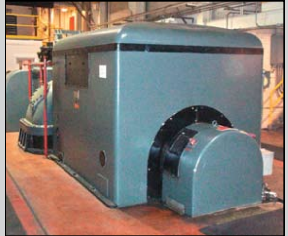
GE STEAM TURBINE AND GENERATOR