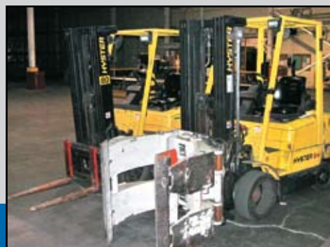
FORKLIFTS W/ROLL CLAMPS