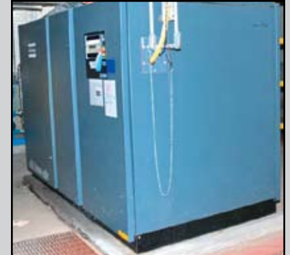
ATLAS COPCO 350 HP COMPRESSOR