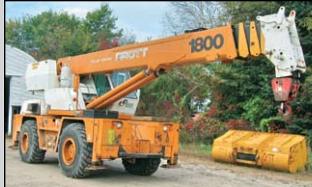
DROTT 1800 HYDRAULIC BOOM CRANE

MILLER Trailblazer 250G Welding Generator.