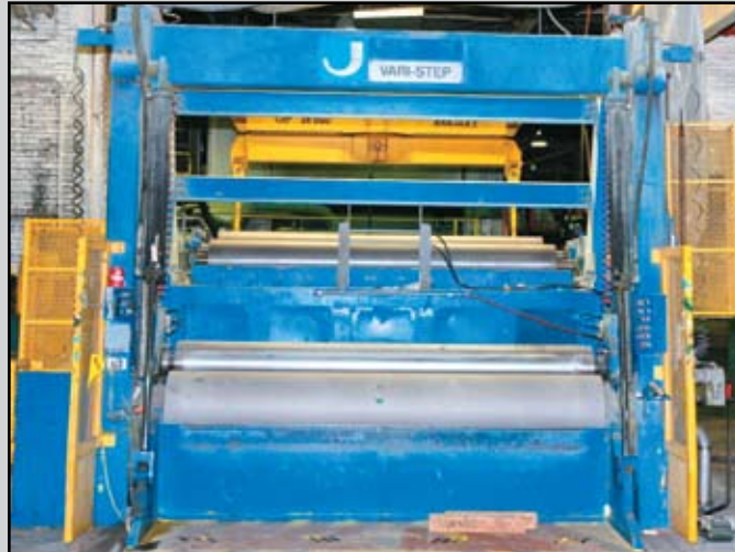
116" W JAGENBERG VARIED STEP 6,000 FPM