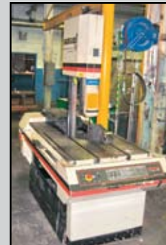
MARVEL VERTICAL BAND SAW