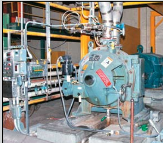
BELOIT 34" EMC 4500