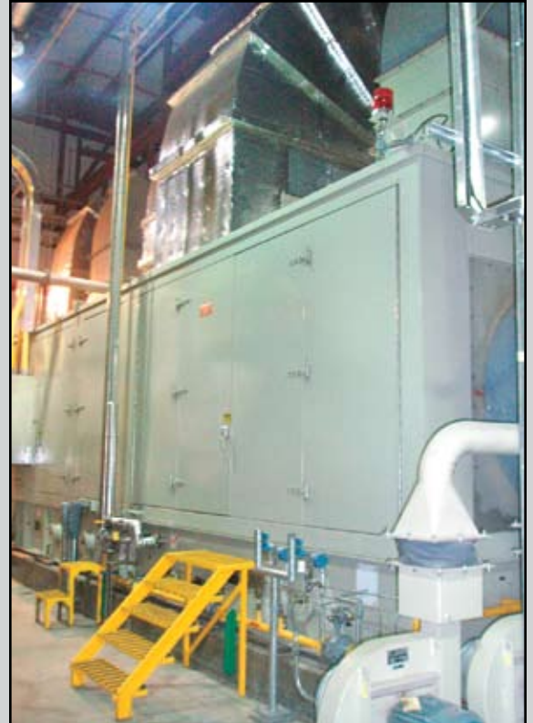
SOLAR TAURUS 7.2 MW NATURAL GAS TURBINE GENERATOR