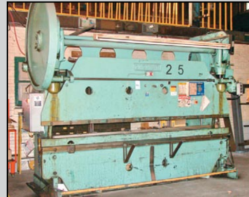
CINCINNATI 12' PRESS BRAKE