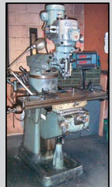
BRIDGEPORT VERTICAL MILLING MACHINE WITH DRO