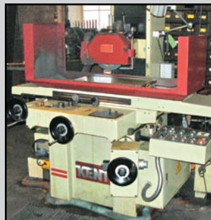
KENT AUTOMATIC HYDRAULIC SURFACE GRINDER