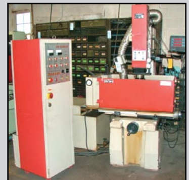
EDM WITH DRO