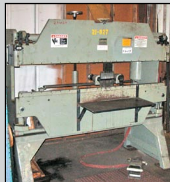
BANTAM PNEUMATIC BRAKE