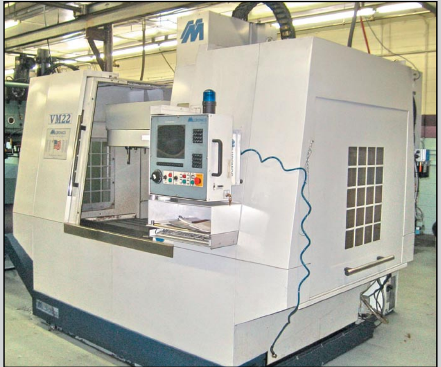
MILLTRONICS VM-22 CNC MACHINING CENTER

For complete catalog crgauction.com 1.800.300.6852