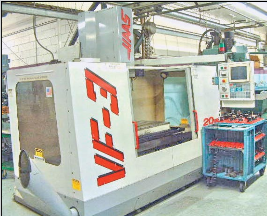
HAAS VF3-D CNC VERTICAL MACHINING CENTER

1998 HAAS VF3-D CNC Vertical Machining Center, 40" x 24" x 20" T-slot table, 20 HP Vector direct drive spindle to 15,000 RPM, w/through spindle programmable coolant system, 20-position ATC, 40 taper spindle, chip conveyor, 4-axis capable CNC controls.