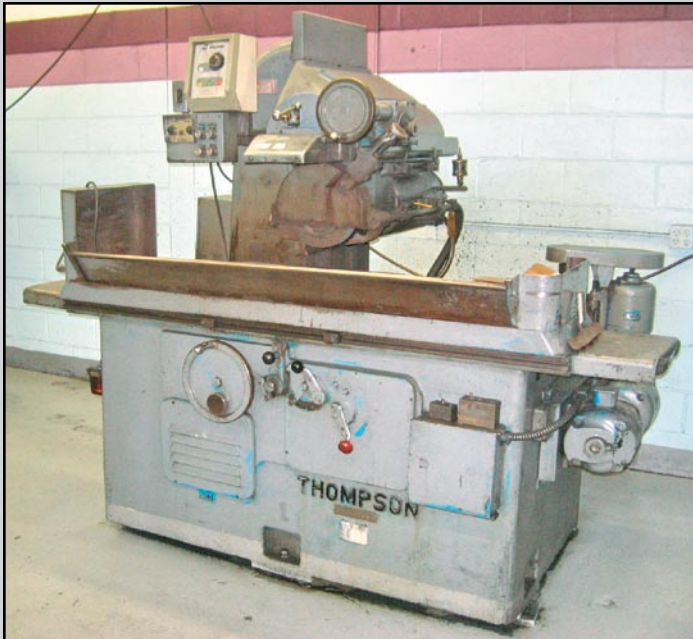
THOMPSON GRINDER, w/WALKER ELECTROMAGNETIC CHUCK