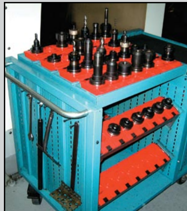
CNC TOOL HOLDERS AND ACCESSORIES

Inspection and Measurement Equipment Including: DELTRONIC MPC-4 Optical Comparator, w/DRO; Hardness Testers; Digital and Dial Height and Bore Gages; CADILLAC Gages; Micrometers; Gage and Pin Block Sets; Sine and Angle Plates; Calipers; and Related Equipment.