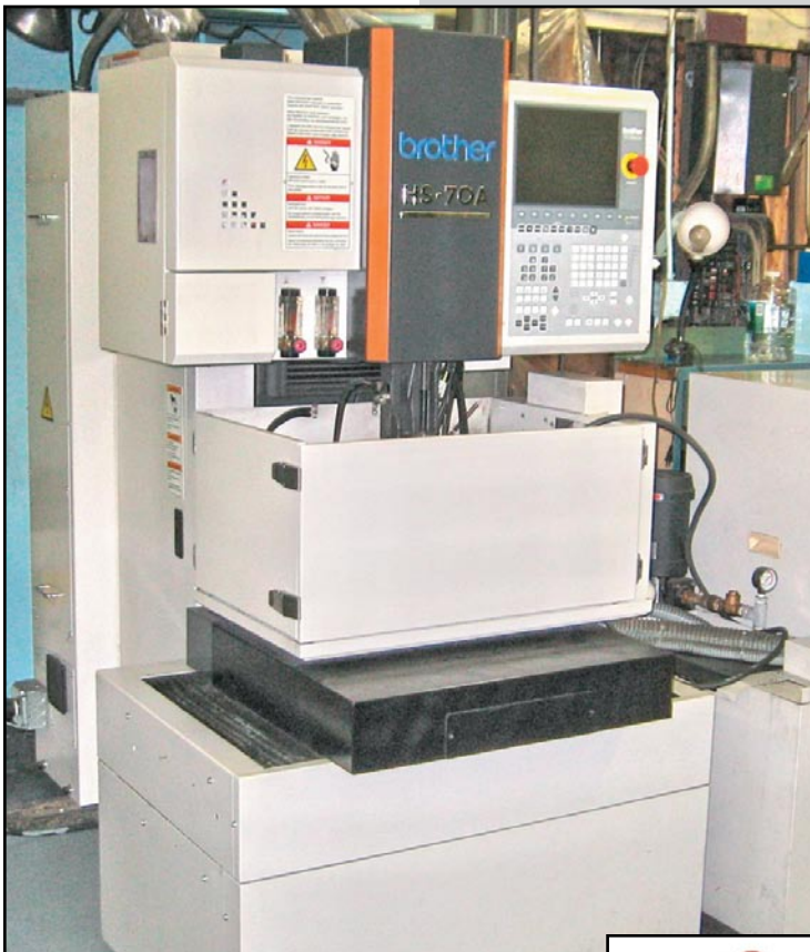
BROTHER CNC WIRE EDM