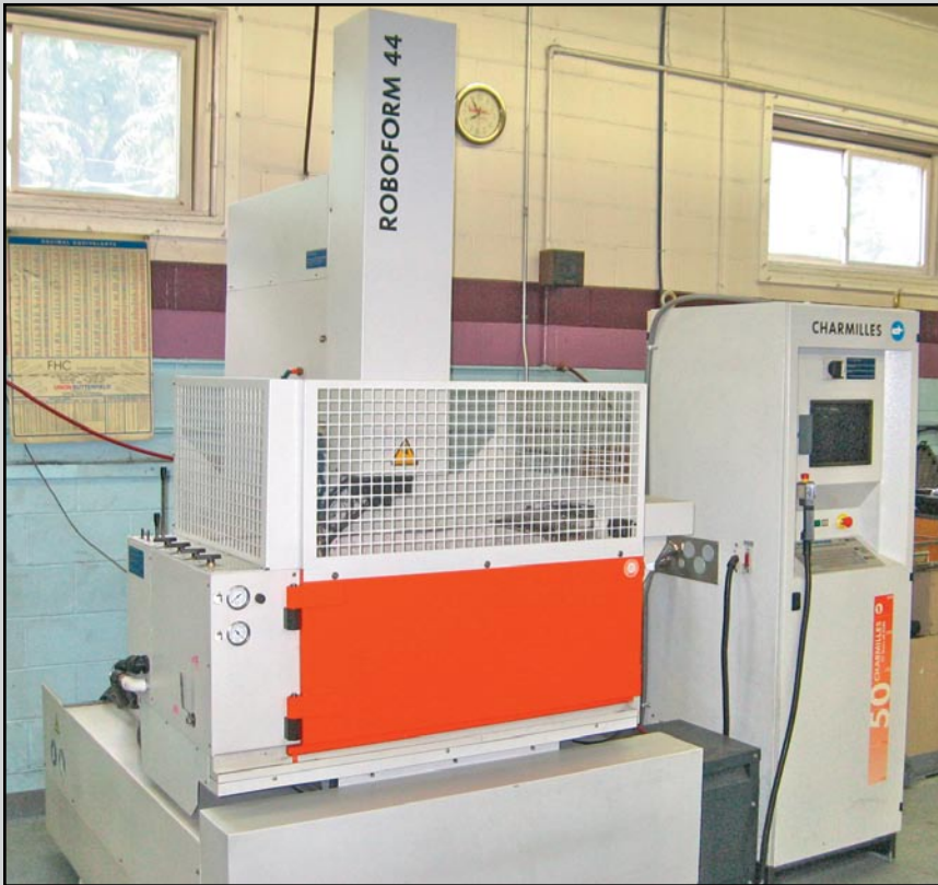
ROBOFORM 44 CNC SINKER EDM

2004 BROTHER HS-70A 6 Axis CNC Wire EDM, Maximum workpiece dimensions: 22.8" x 15.3" x 6.7", X and Y axis stroke: 16.1" x 10.2", 360 L tank volume, 6-axis CNC controls with color display, auto threading, wire chopper, dielectric fluid filter and chiller system.