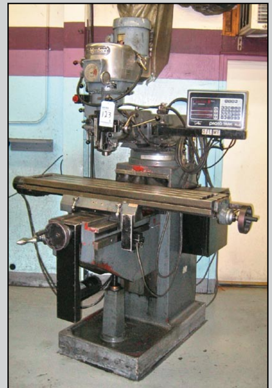
BRIDGEPORT 2 HP VERTICAL MILL, w/PROTOTRAK 3-AXIS DRO