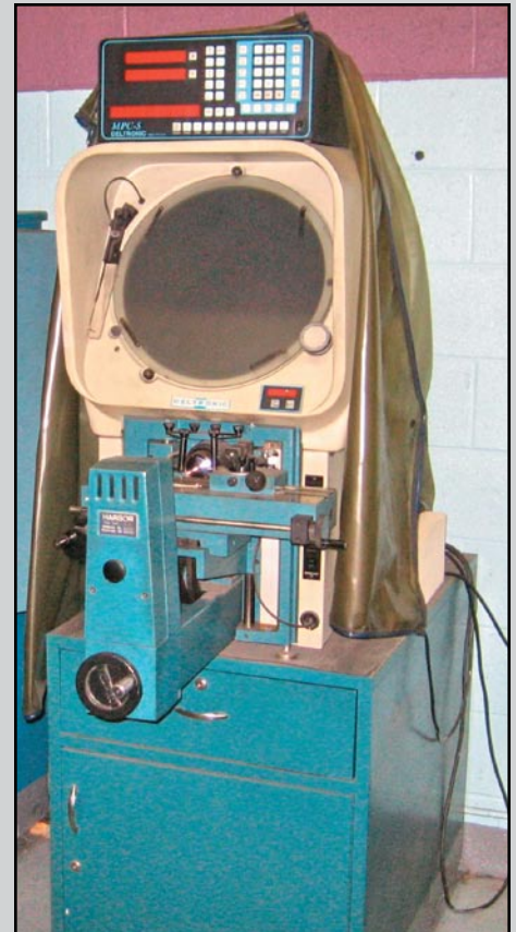
DELTRONICS OPTICAL COMPARATOR

LEASE FINANCING AVAILABLE • Maximize your bidding power! Get Pre-Approved for up to $75,000 in lease financing. For more information call the AuctionLea$e department at 800.438.1470. To apply on-line go to www.auctionlease.com