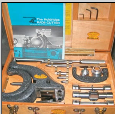
SAMPLE MACHINE TOOL ACCESSORIES