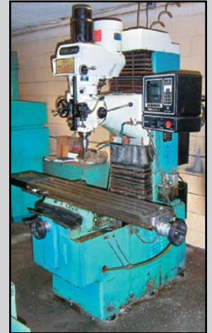
TRAK CNC VERTICAL MILLING MACHINE