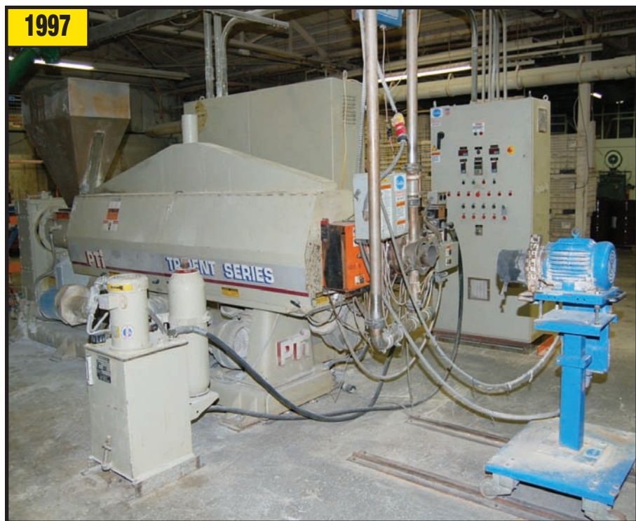
PTI Trident 4.5" Pelletizing Line

DIRECTIONS TO PLANT: Seabrook, NH is 40 miles north of Boston. Take Rte. 95 to N.H. Exit #1, bear right onto Rte. 107, 500 yds. to 1st left on Spur Rd., left on New Zealand Rd. to end.