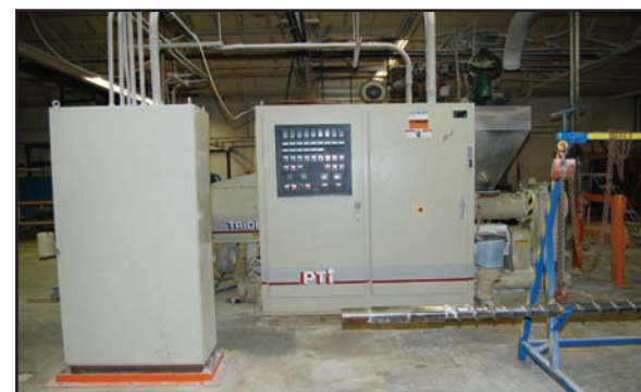
PTI Trident Control Cabinet