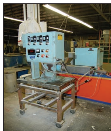
Killon Lab Extruder