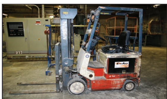
Nissan 2300# Elec. Forklift