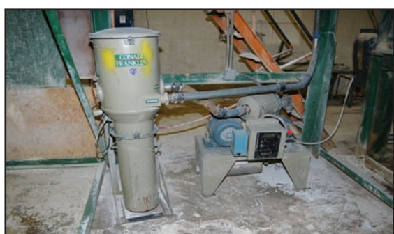
Conair Blower & Filter