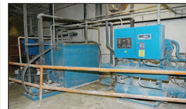
AEC 70 Ton Chiller