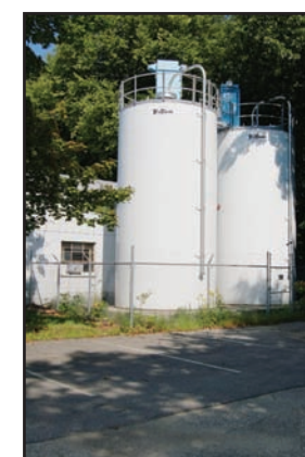
TEC TANK Silos