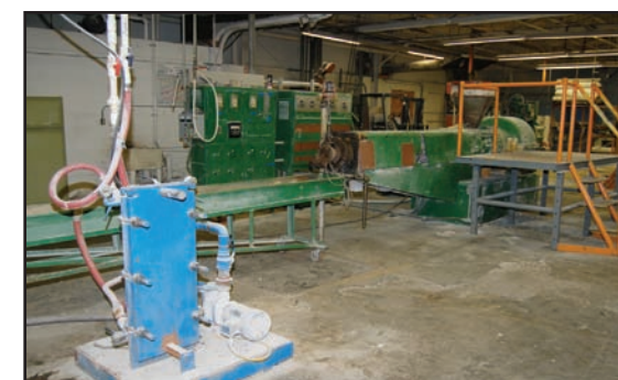
JSW 4.5" Extruder

CRG Capital Recovery Group, LLC 800-300-6852 www.crgauction.com