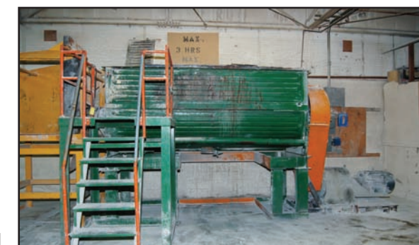
5000# S.S. Jacketed Blender