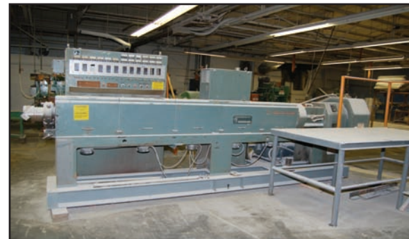
Gloucester 4.5" Extruder