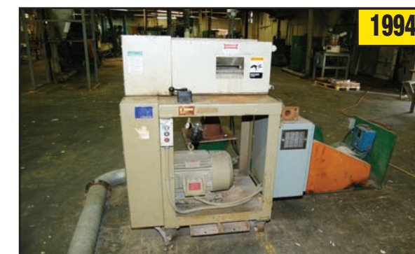
Cumberland #6 Pelletizer