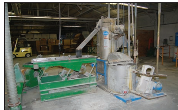
Gala Dryer, Separator, Screen