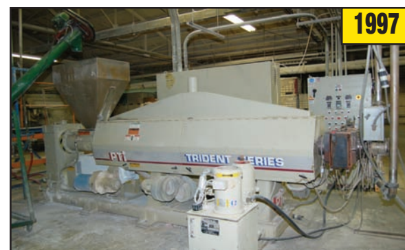
PTI Trident 4.5" Extruder