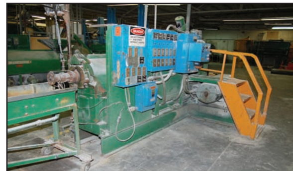
1 of 4 Davis Standard Extruders

ONSITE • PUBLIC AUCTION • ONLINE Colors, Compounds & Consultants 72 New Zealand Road Seabrook, NH Wednesday, September 24th Starting at 10:30 AM