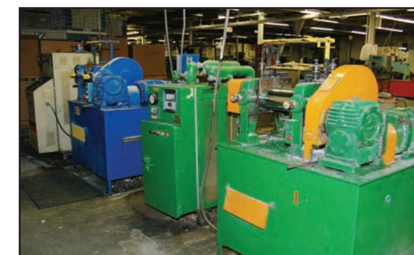
(2) 6"x12" 2 Roll Mills