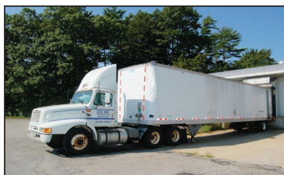
International Tractor & Trailer