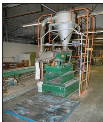
Scale, Screen, Cyclone