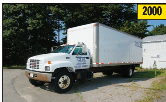
GMC 7500 24' Box Truck