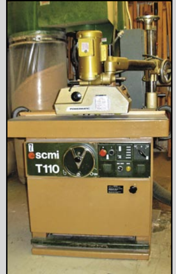
(1 OF 2) SCMI SHAPERS, w/FEEDERS