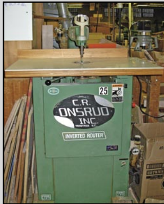
OSRUD INVERTED ROUTER