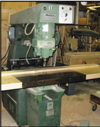
WADKIN OVERHEAD PIN ROUTER