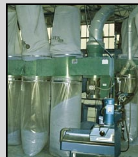
DUSTEK DUST COLLECTION SYSTEM

To be sold in accordance with CRG Terms of Sale as published on our Web site and in the auction catalog. A 10% buyer's premium will apply.