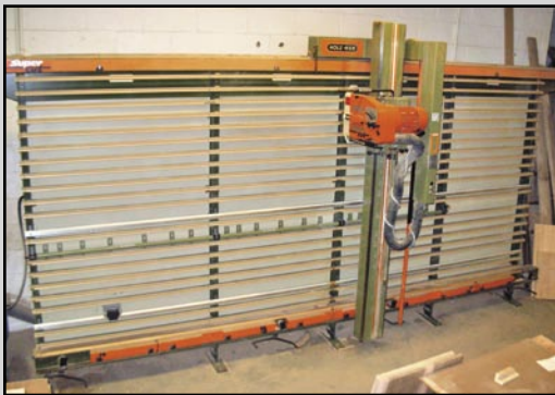
HOLZ-HER SUPER CUT PANEL SAW