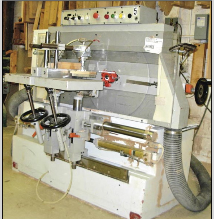
BACCI TSG-2T TENONER

For complete catalog crgauction.com 1.800.300.6852