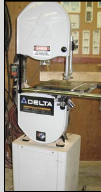
DELTA PORTABLE VERTICAL BAND SAW