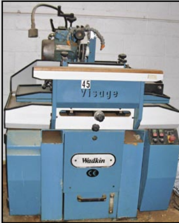
WADKIN CUTTER GRINDER