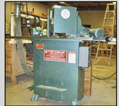
PISTORIUS DOUBLE MITER SAW