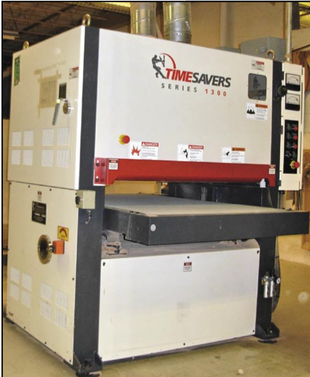
TIMESAVER WIDE BELT SANDER