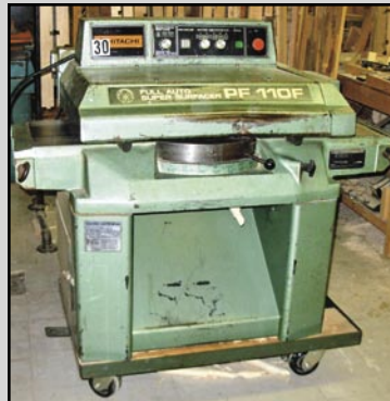
HITACHI ROTARY PLANER

(2) 12" Disc Sanders; Brush Sander; 6" Belt and 12" Disc Sander.