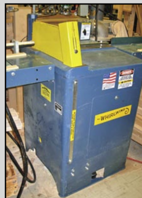
WHIRLWIND 12" PNEUMATIC UPCUT SAW

Extensive Selection of Power Hand Tools Including Routers; Compound and Sliding Miter and Chop Saws; Drills; Drill Presses; Portable Band Saws; And More!