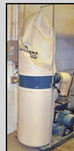
PORTABLE DUST COLLECTOR