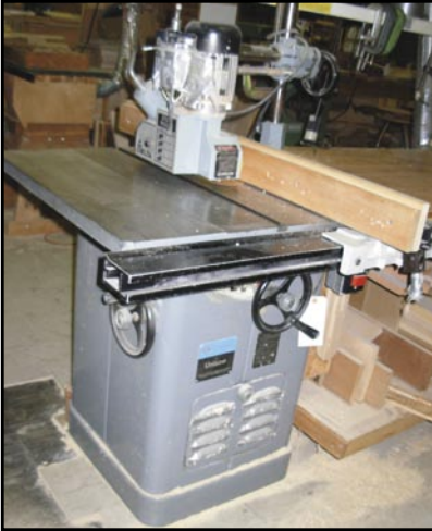
DELTA UNISAW, w/FEEDER