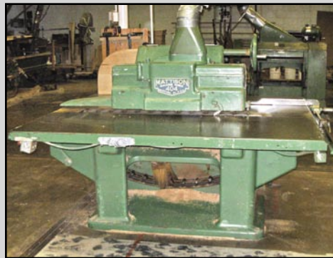
MATTISON 404 RIP SAW