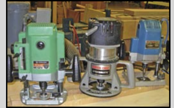
ASSORTED HAND ROUTERS