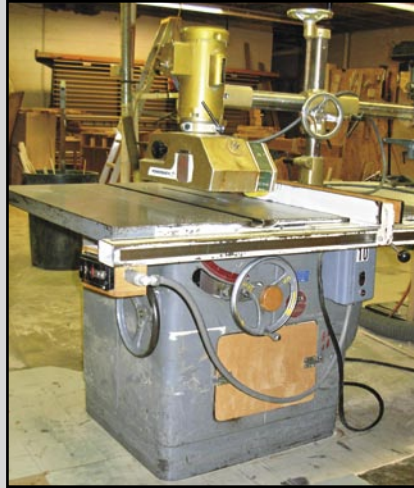
DELTA TILTING ARBOR TABLE SAW, w/FEEDER