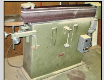
PROGRESS EDGE SANDER