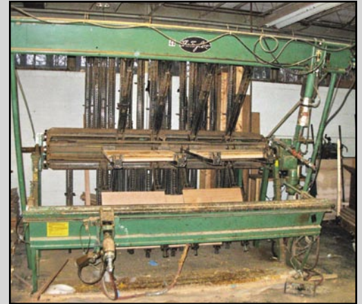
TAYLOR CLAMP CARRIER