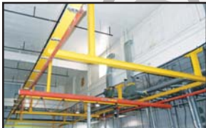
Freestanding crane system