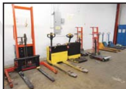
View of factory equipment