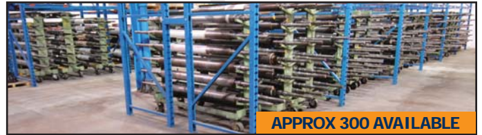
View of printing cylinders for WINDMOELLER & HOLSCHER press