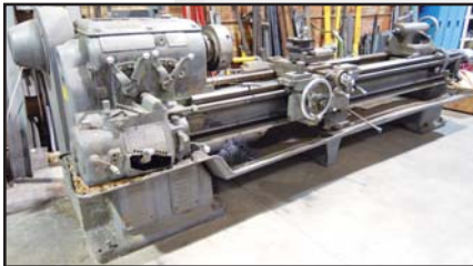
MONARCH engine lathe