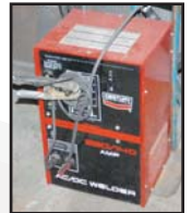
CENTURY 230/140 amp arc welder