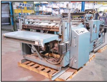
SHELDAHL 308 TYPE GT 41" bag machine