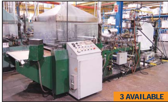
FMC 85 bag machine