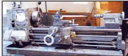
TIDA TD-5AA engine lathe