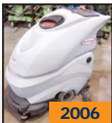
IPC CLT60B50 floor scrubber