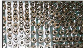
View of gears for UTECO press