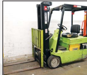
CLARK TM15 indoor electric forklift