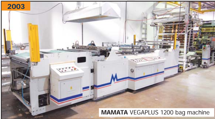
2003 MAMATA VEGAPLUS 1200 bag machine