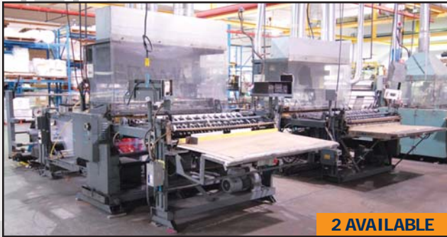
SHELDAHL B308 TYPE 56T 56" bag machines