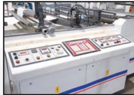
View of MAMATA VEGAPLUS 1200 controls