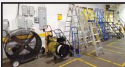
View of factory equipment