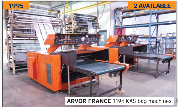
1995 ARVOR FRANCE 1194 KAS bag machines