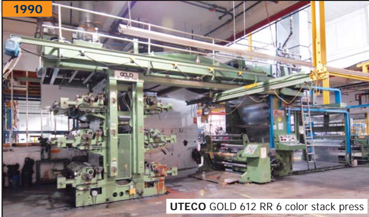
1990 UTECO GOLD 612 RR 6 color stack press