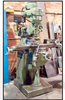
EXCELLO vertical milling machine