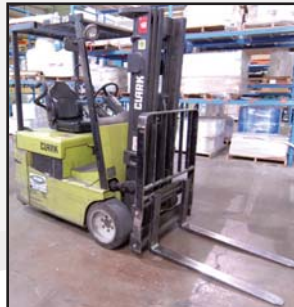
CLARK TMG20 indoor electric forklift