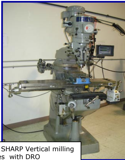
(1 of 3) SHARP Vertical milling machines with DRO

Extensive selection of CNC tool holders, KURT machine vises, collet sets, machine tool accessories, perishable tooling, tool cabinets, assembly equipment, measurement equipment, DE bench grinders, arbor presses, and much more!