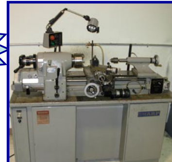
SHARP precision tool room lathe