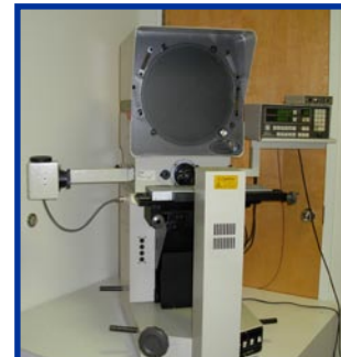
Mitutoyo PH3500 OC with DRO

All Equipment in New and Like New Condition!