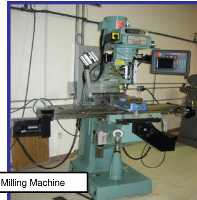
TRAK K-2 CNC 3 Axis Vertical Milling Machine