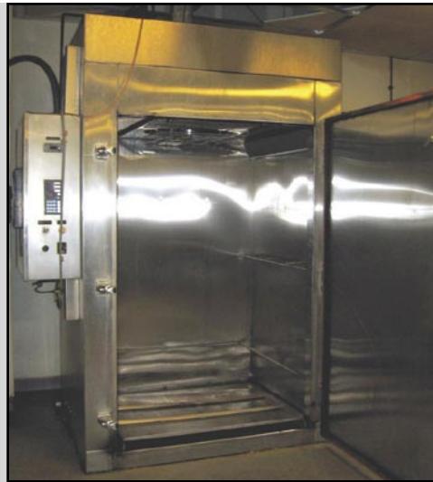
2000 KEMTEC STAINLESS STEEL RACK SMOKER, w/PLC CONTROLS