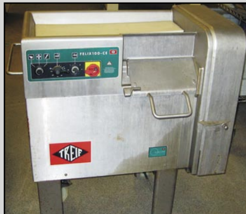
2000 TREIF FELIX STAINLESS STEEL DICER