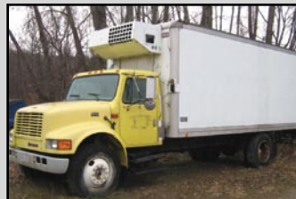
1996 INTERNATIONAL REEFER TRUCK