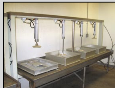
120 x 36 x 36 SS TOFU PRESS