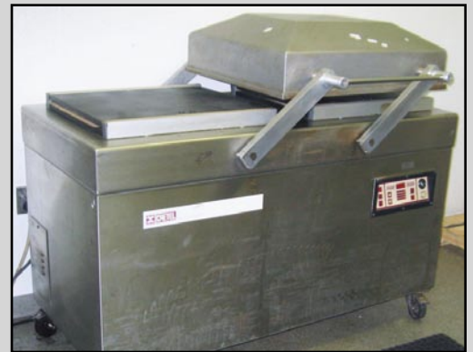
CRETEL STAINLESS STEEL VACUUM PACKER