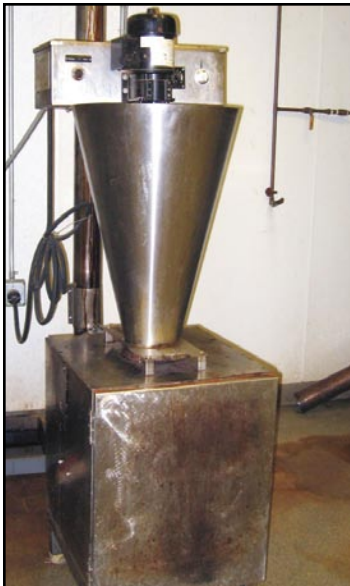
KEMTEC WOOD SMOKE GENERATOR, FOR RACK SMOKER