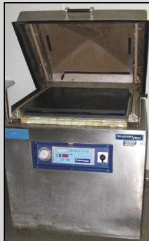
SMITH SUPERVAC VACUUM PACKER

Stainless Steel Custom Fabricated Soaking Vessel , 48" x 48" x 24", w/skid bottom.