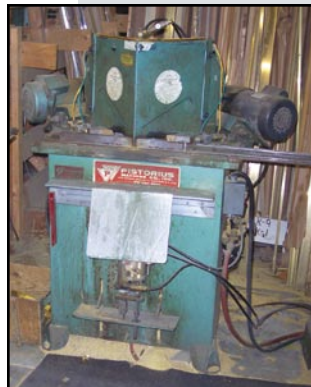
PISTORIUS MITER SAW

1985 BYTRONIC Mdl. XYZ-78 NC Flat Glass Panel Cutter , S/N 13774-1, 112" x 166" hydraulic tilting vacuum infeed table, 112" x 166" TGCT air float outfeed table.