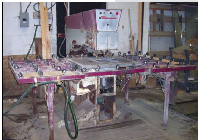
GLASS BORING MACHINE

Assorted Hand Tools; Vacuum Lifters; Assembly Tools; Related Equipment.