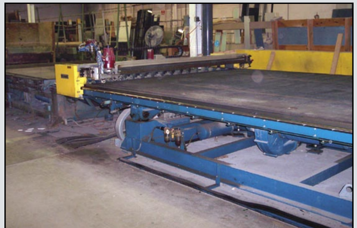
GLASS BRIDGE SAW

For complete catalog go to crgauction.com or call 1.800.300.6852