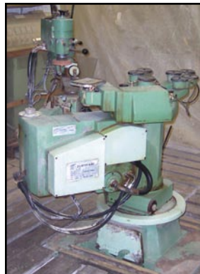
CONTOUR BEVELING MACHINE, w/AUTOMATIC CONTROLS