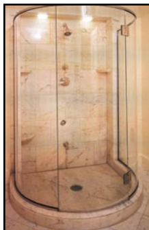
ROUND SHOWER ENCLOSURE