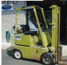
CLARK 3,000 LB. CAP. MODEL C 300 50 SIDESHIFTER FORKLIFT