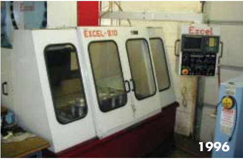
EXCEL 810 CNC VERTICAL MACHINING CENTER