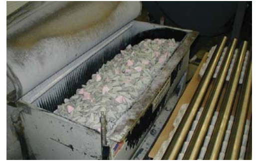
VIBRATORY TUB FINISHING MILL