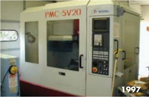
EXCEL PMC 5V20 CNC VERTICAL MACHINING CENTER