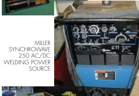
MILLER SYNCHROWAVE 250 AC/DC WELDING POWER SOURCE