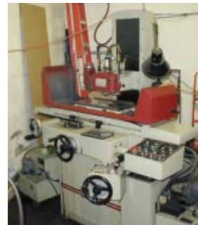
KENT KGS-250 AHD 8" X 18" PRECISION SURFACE GRINDER