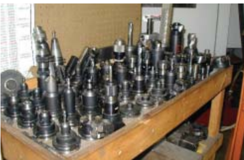
CAT 40 TOOLING