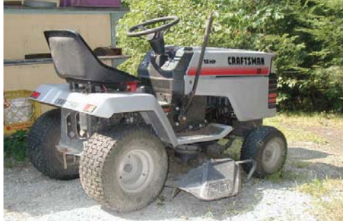
CRAFTSMAN RIDING LAWN TRACTOR