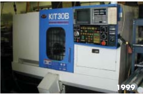
KIA KIT 30B CNC GANG-TYPE CNC SLANT BED