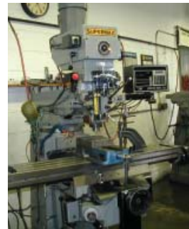
SUPERMAX YCM-16VS VERTICAL MILLING MACHINE