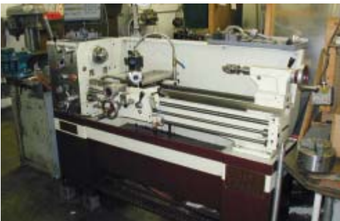
ACER DYNAMIC 1340 ENGINE LATHE