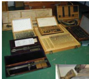
NUMEROUS QUALITY CONTROL & INSPECTION GAUGES