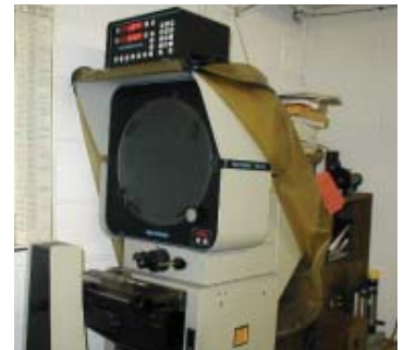
DELTRONIC DH 214 14" OPTICAL COMPARATOR